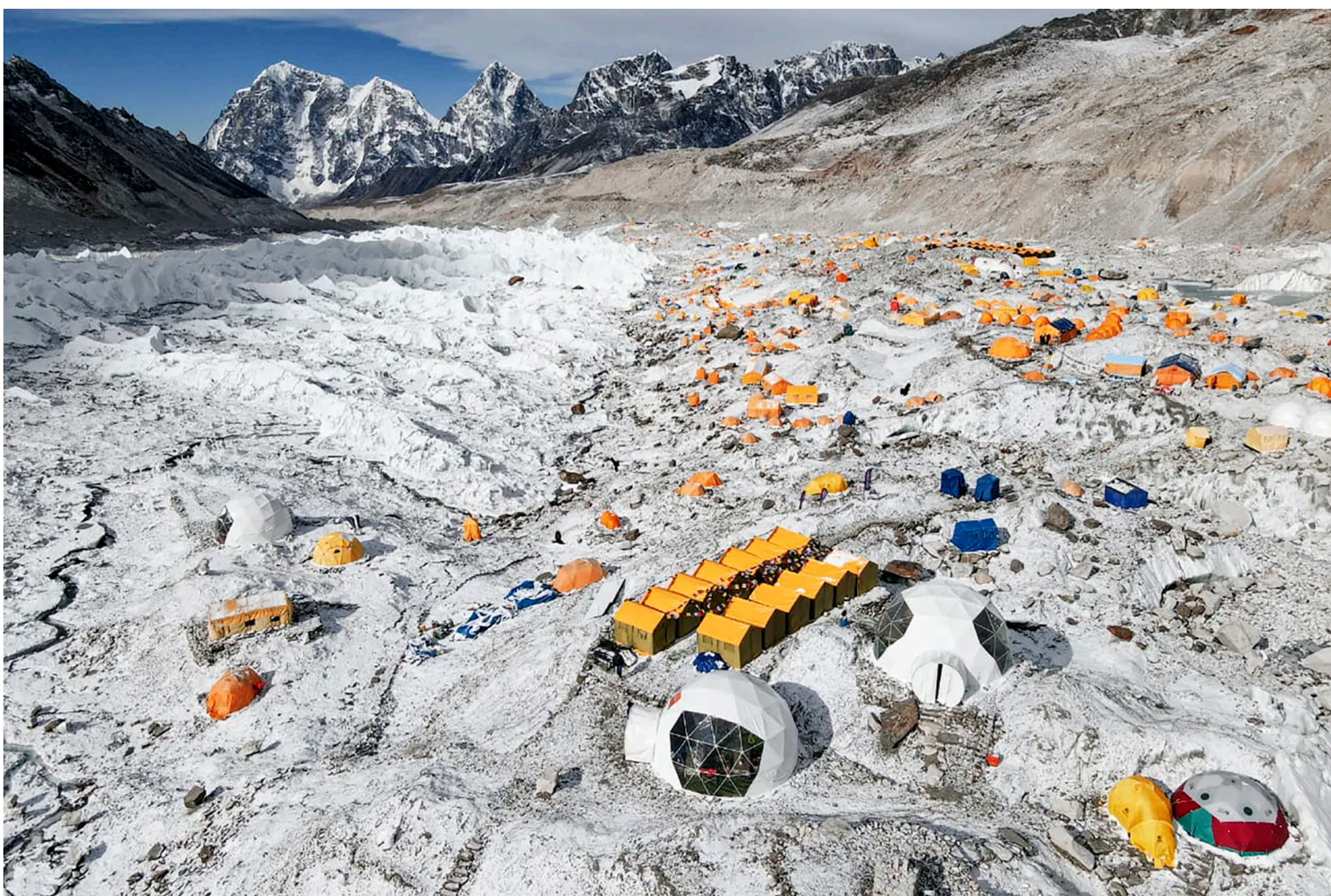
Everest base camp.

Nepal is moving the Everest base camp off of the melting Khumbu glacier, the BBC reported .