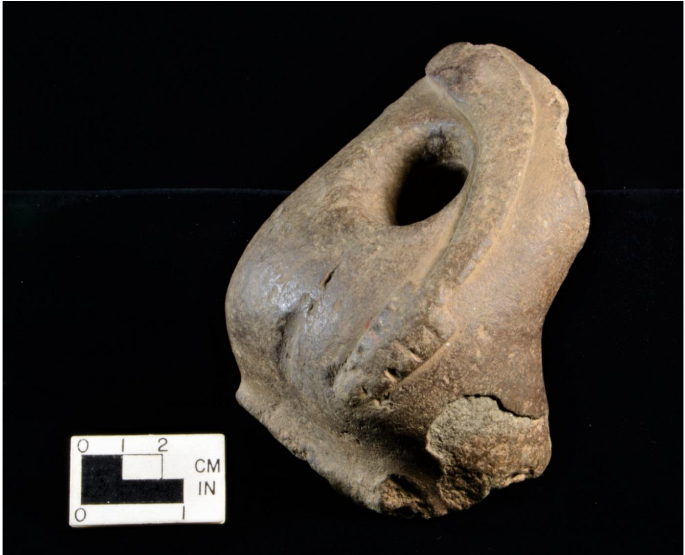
Figure 3. Fragment of a Late Prehistoric period sandstone pipe found in Morgan County, Ohio, depicting a naked, kneeling human figure with a serpent extending diagonally across its back. The regrettably small portion of the sculpture that remains is consistent with other Mississippian representations of First Woman and her consort, the Great Serpent (Duncan and Diaz-Granados 2018b:68). William Hook collection, Ohio History Connection (A76/001).

imperfectly transmitted between generations; ceremonies whose symbolism has changed to become supportive of new values; origin myths naturalized to new locations; ceremonial objects whose full significance was known only to elders who have died; the bones of Indians whose deaths silenced personal stories that await telling; buried artifacts that speak of technologies long forgotten; and earth constructions that speak of rituals long abandoned.” Robert L. Hall (1997:169)