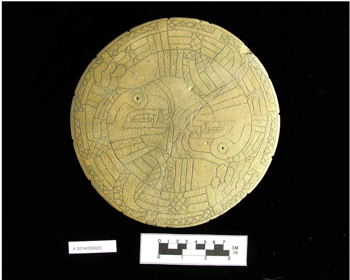
Figure 5. Mississippian sandstone tablet with an engraved design incorporating two intertwined serpent creatures with rattle-snake tails and the opposing canine teeth of a mammalian carnivore, possibly a felid (Prentice 1986:245). These are typical of the “often-bizarre configurations of dragon-like creatures whose images invoke mystery and hidden knowledge” (Reilly and Garber 2007:2) that were an important component of the Mississippian artistic tradition. The tablet often is referred to as the “Issaquena Disk” for Issaquena County in Mississippi where it was found. Marshall Anderson collection, Ohio History Connection (A14/023).

Mound is another possible example as it is built on a prominent bluff just upriver from and in sight of the Newark Earthworks. Cook suggested that this was an intentional strategy of non-local Mississippians “to establish a connection to local traditions” (2017:118); and it provides a compelling explanation for why the Mississippians, or the Mississippianized Fort Ancient culture, would have built Serpent Mound in close proximity to existing Adena burial mounds.