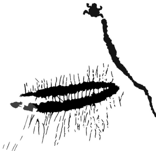
Figure 2. A portion of Panel 3 from Picture Cave, Missouri, showing the three glyphs that correspond to the three principal elements of Serpent Mound as mapped by MacLean. The Great Serpent (Glyph 67), First Woman (Glyph 64), and the large oval vulvoid (Glyph 59) (Diaz-Granados et al. 2015). These images are thought to be associated in a single composition not just because they are adjacent to one another, but also because they appear to have been painted with the same pigment and application technique. Drawing by Peter Lepper.

With regard to the wishbone-shaped earthwork at the head of Serpent Mound, Romain (2019:60) states